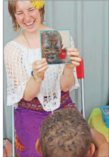
Face painting fun