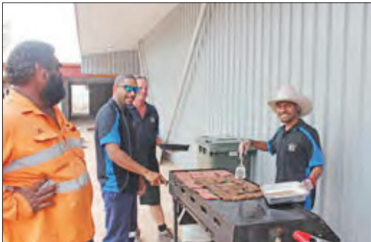
Cooking up the yummy barbie