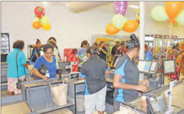
The supermarket was buzzing with excitement at its official opening