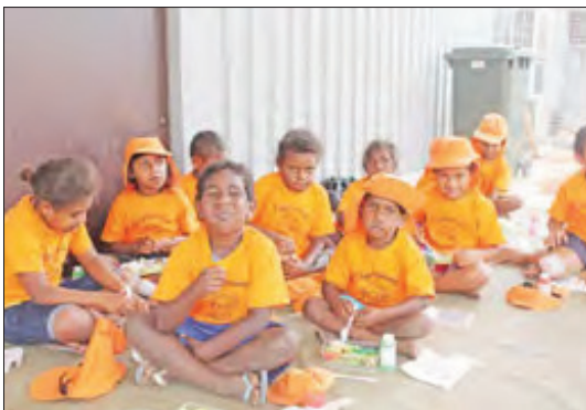
Napranum Pre-school students enjoy a healthy lunch